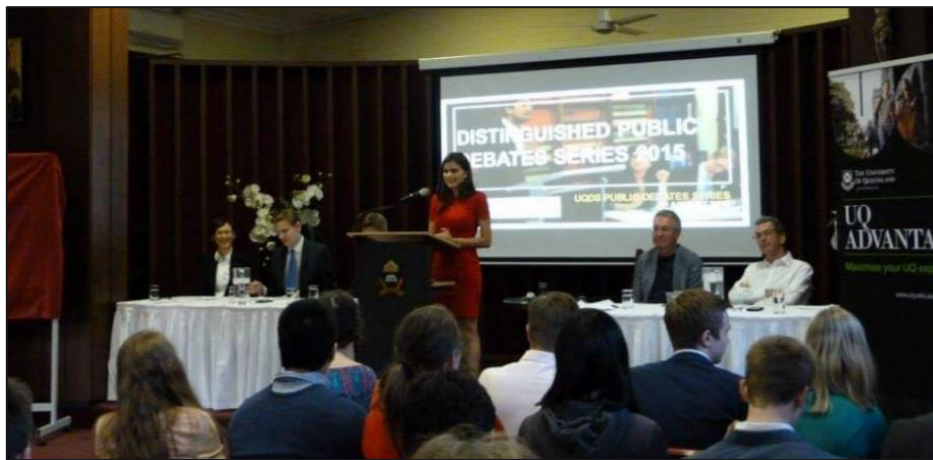
UQDS Public Debate, 2015

The UQDS, in collaboration with other Student Societies, the University of Queensland Union, and various UQ Faculties, facilitates the hosting of public debate events on campus in the tradition of the Oxford Union. Debates have been held on a broad range of topics in previous years including the merits of gene-editing and nuclear power, to issues such as data privacy and artificial intelligence which have become increasingly relevant in a rapidly advancing world. Attendance of public debates typically numbers in the hundreds and presents a fantastic opportunity for the Society to engage the broader UQ community. We invite sponsors of these debates to send representative speakers should they wish.