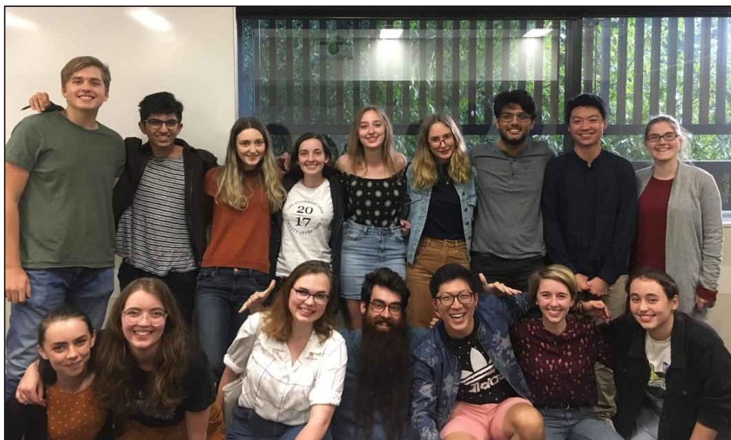
Participants of our Novice Intersociety Competition

Entering the world of debating, like starting any new activity, can often prove a daunting experience at first. We do our utmost to encourage our new debaters and develop their skills. This includes hosting a range of events and competitions targeted at novice development and the consistent efforts of our two permanently appointed Novice Officers tasked with guiding new members through their first years as UQDS debaters. The Novice Social presents yet another opportunity to do precisely this, providing novice debaters with the chance to mix and mingle with one another, our older more experienced members, our Executive Committee and our Novice Officers. This event is held at the beginning of the Semester One.