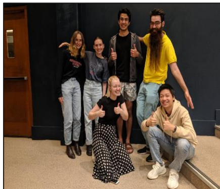
Semester 1, 2019 UQDS Internal Competition Grand

The UQDS hosts three rounds of practice debates which pair experienced (professional) and new (amateur) debaters at the beginning of each semester. This enables our newest members to learn at the feet of experienced debating minds.