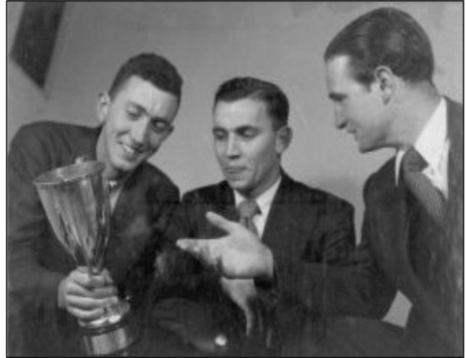
UQ Having Won the Australian Intervarsity Debating Championships, 1953

The Society, as it stands today was established in 1960 making it the oldest society at the university. However, structured debate has been a significant component of campus culture at UQ since the university's foundation in 1909, at which time the institution's first Intervarsity Debating Team was created. The UQDS has a proud history of allowing, preparing and encouraging UQ students to participate in and contribute to public discourse on a range of topical issues.