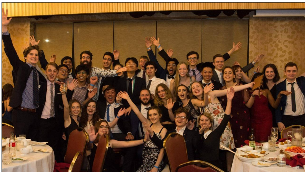
The UQDS Australian Intersvarsity Debating Championships Contingent, Sydney, 2019

The first major tournament of the year, The Australian Intersvarsity Debating Championships, emphasises debating development and is typically the first major competition new debaters will attend. Approximately, 250 debaters attend from across the country. The UQDS has historically been highly successful at this competition, consistently qualifying teams for finals rounds and in 2018, reaching the Quarter-Finals. In 2020, UQ will send 28 debaters to this competition, hosted in Canberra by the Australian National University.