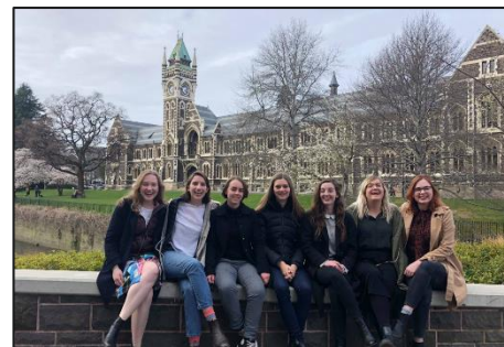
UQDS at the Australian Wom*n's Debating

The UQDS has a proud record of engaging, empowering and retaining female debaters, evidenced by our equal opportunities commitment, participation in women-only training days and debates, and rigorous adherence to tournament Affirmative Action policies. Sponsoring UQDS provides you with the opportunity to enhance your firm's visibility to exceptional female debaters from around the world.