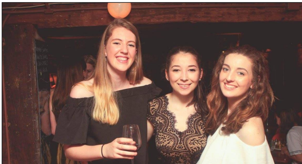
UQDS Summer Ball, 2016

Held annually in the month of October, the Summer ball is the Society's flagship social event. Always highly anticipated, this social event provides an opportunity for all members to gather at an off-campus venue and celebrate the year that has come. Prizes are awarded at this event to recognise the best and most improved novice and veteran debaters. Further, this event is also where we celebrate the achievements of the outgoing Executive Committee and welcome those to serve on the committee in the next calendar year.