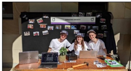
UQDS Registering New Members at Market Day, Semester 2, 2019

Sponsors gain the opportunity to market their company or organisation to a highly engaged social media community. The Public UQDS Facebook Page has over 1,350 followers who are actively engaged with the Society online. Further, the Society has an active mailing list of members and alumni who we regularly contact and deliver information to. The UQDS also hold stalls at university Market Days. These are campus-wide events which occur twice a year (at the start of each semester), giving students the opportunity to purchase membership to various student-led societies and clubs. Foot traffic on these days is approximately 40,000 people, consisting of students and staff from across the university. We are able and willing to distribute your entity's promotional material at this event. Lastly, the Society also regularly host Public Debates on topical issues which draw large crowds (hundreds) of students and staff alike. Sponsorship of these debates provides excellent potential for exposure to the broader UQ community.