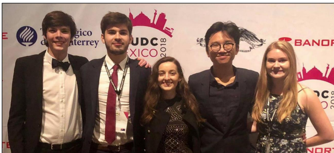
2018 UQDS Contingent at the World University Debating Championships in Mexico City

The World University Debating Championships is the premier international debating tournament, held over the Christmas Break, during which debaters from all over the globe come together. Approximately 800 debaters from the world's top debating institutions are typically in attendance. This competition is typically a tournament to which UQ sends its most experienced and talented debaters, and they enjoy regular success. This competition will be held at Assumption University (Suvarnabhumi campus) in Thailand over the 2019-20 New Year. The 2020-21 competition will be held in South Korea.